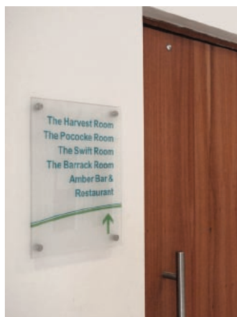
Acrylic Directory System