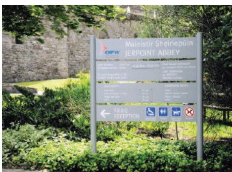
Extruded Aluminium Directory System