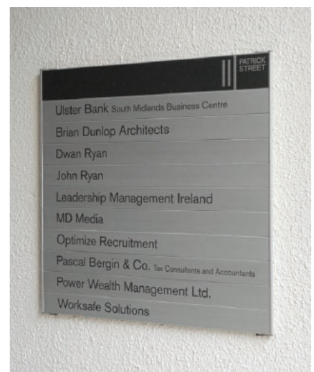
Aluminium Panel Directory System