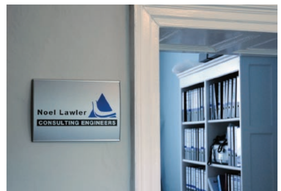
Silver Anodised Door Plate