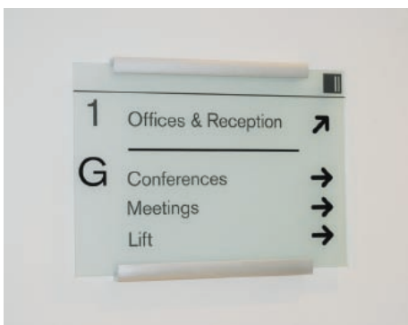
Acrylic Directory System